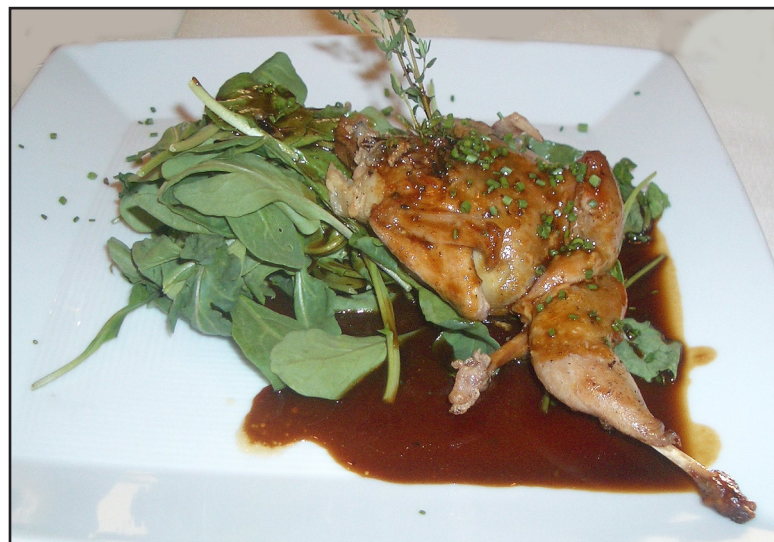
Pan Roasted Stuffed Quail