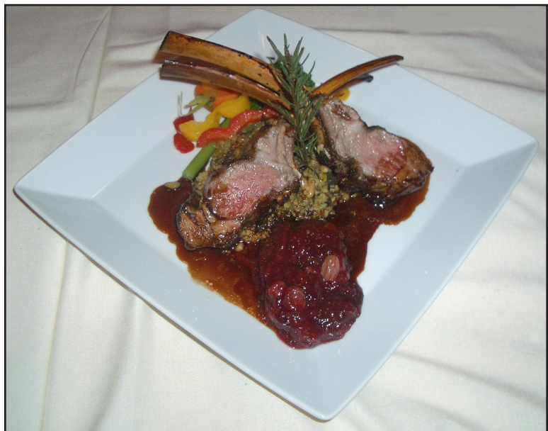
Sonoma County Fresh Rack of Lamb